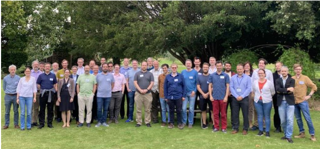
Group photo at Cosener's house

FEL demonstration and ion acceleration from cryogenic jet targets. They also introduced the HELPMI project, aimed at developing a data standard for LPI experiments.